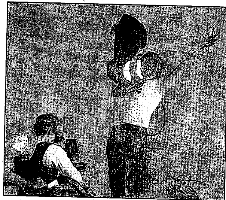
SWEET EMOTION: Aerosmith's Steve Tyler strikes a pose during a video shoot at Duxbury Beach. Tyler and fellow band member Joe Perry attracted a crowd while taping a music segment for the ESPY awards. See photo spread on page 29.